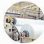
PULP & PAPER INDUSTRIES